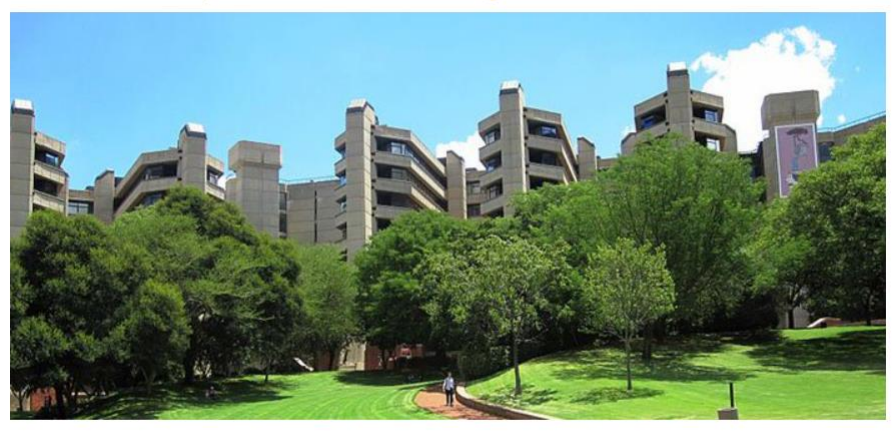
Up from 601-650 to 551-560 this year, the University of Johannesburg is the youngest university in South Africa to feature in the QS World University Rankings, having been formed from a merger of earlier institutions as recently as 2005.